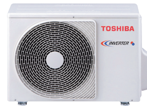
Size 404 and 564

Key features include high energy efficiency performances in cooling and heating and a choice of two selections for the air inlet section: bottom or back side.