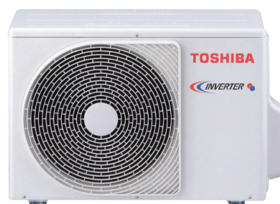
Size 563 &amp; 803

The units are suitable for use with either new R410A refrigerant pipe work, or indeed can be used as 'replacement technology' enabling the re-use of existing R22 or R407c Pipe work.